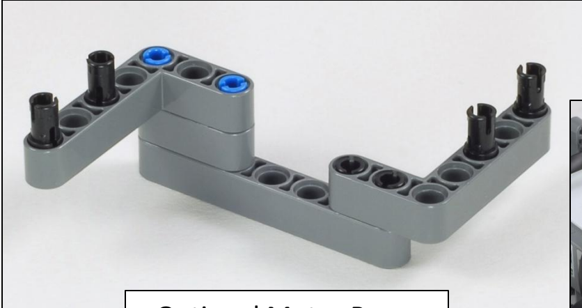
Optional Motor Brace Reinforces motor attachment